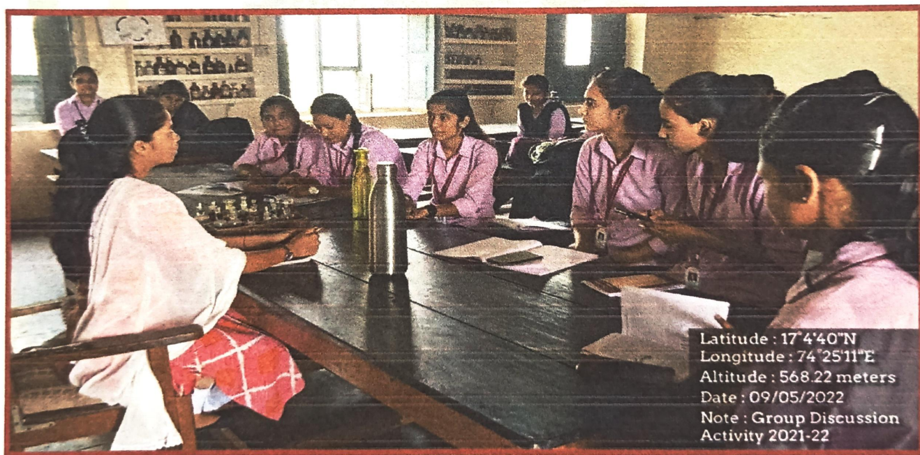
Group III students while explaining importance of Biodiversity.