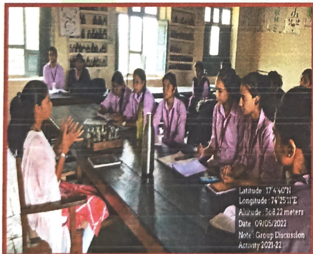
Organization of Group Discussion Activity