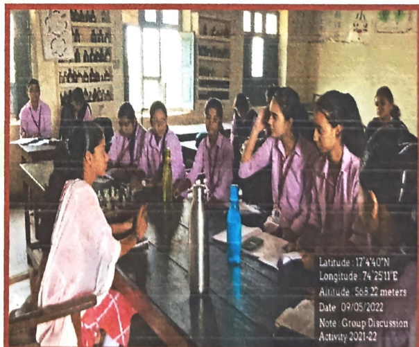
B.Sc. Part II students participating in Group Discussion Activity.